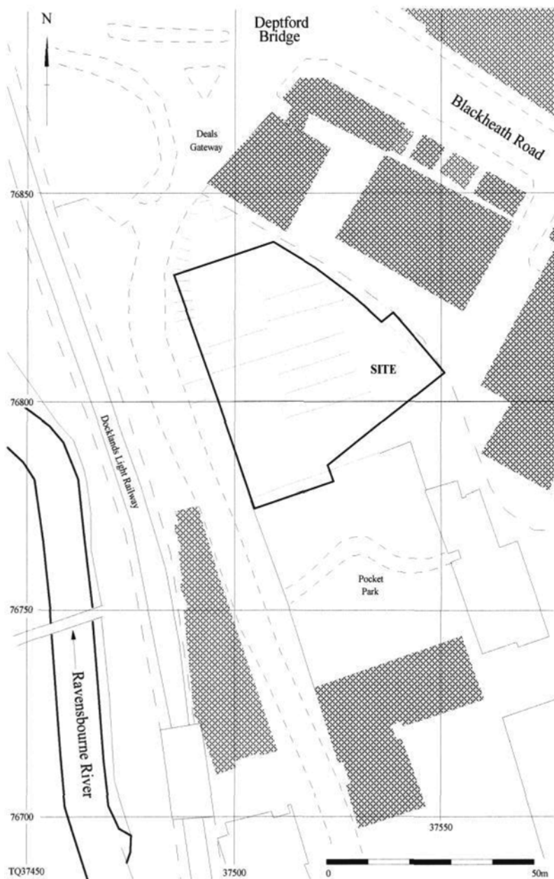
Fig. 1 Location of site.